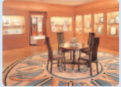
Room of fame