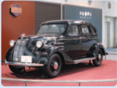
Model AA passenger car