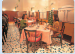
Restaurant "Brick Age"