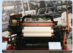
First Type G automatic loom