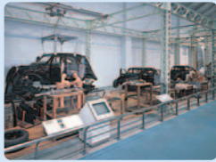
Assembly plant for Model AA passenger car