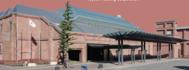
Front entrance Cover/Circular loom

The Spirit of Being Studious and Creative, and the joy of Making Things. Come and see, know experience.