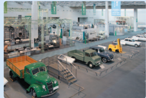
Overview of exhibition section