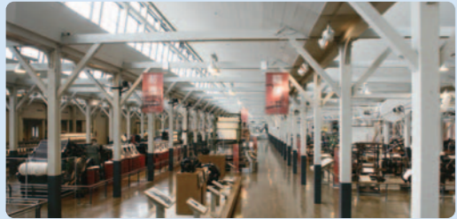
Overview of exhibition section