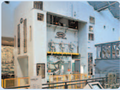
600-ton press made by Danly