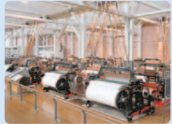
Group running of Toyoda automatic looms, Type G