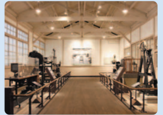
The Materials Testing Center