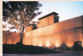
Garden of motive power

[Site area] 41,600 m 2 [Total floor area] 27,100 m 2 [Exhibition area] 14,300 m 2