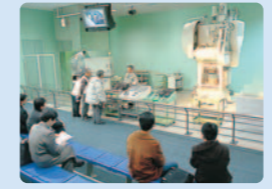
Demonstration of Metal Working Technologies (Casting, Forging, Cutting)